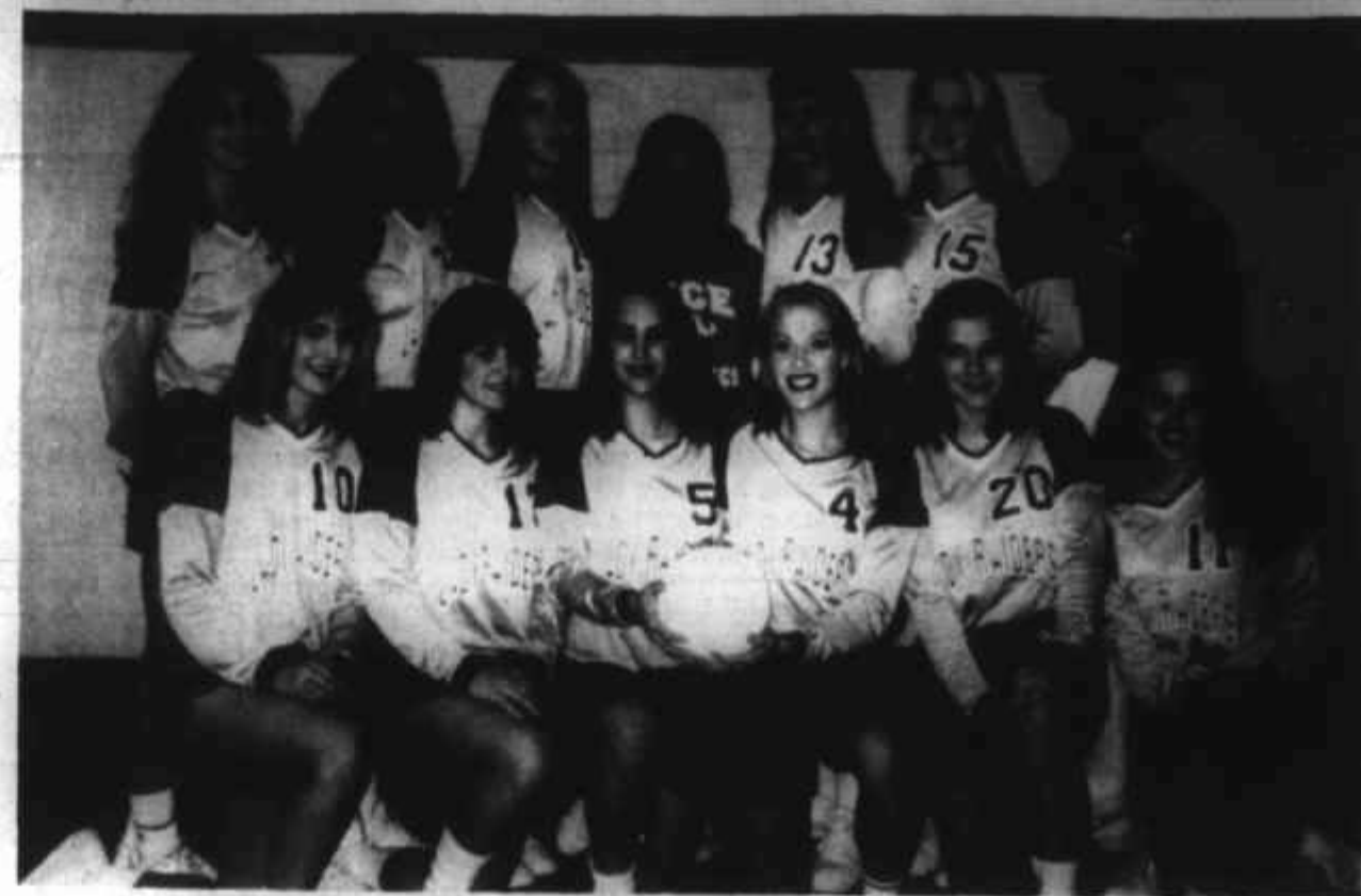
1995 Lady Raider Varsity volleyball team