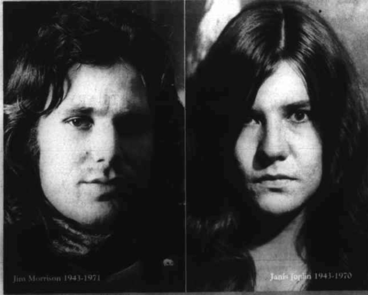
Jim Morrison 1943-1971