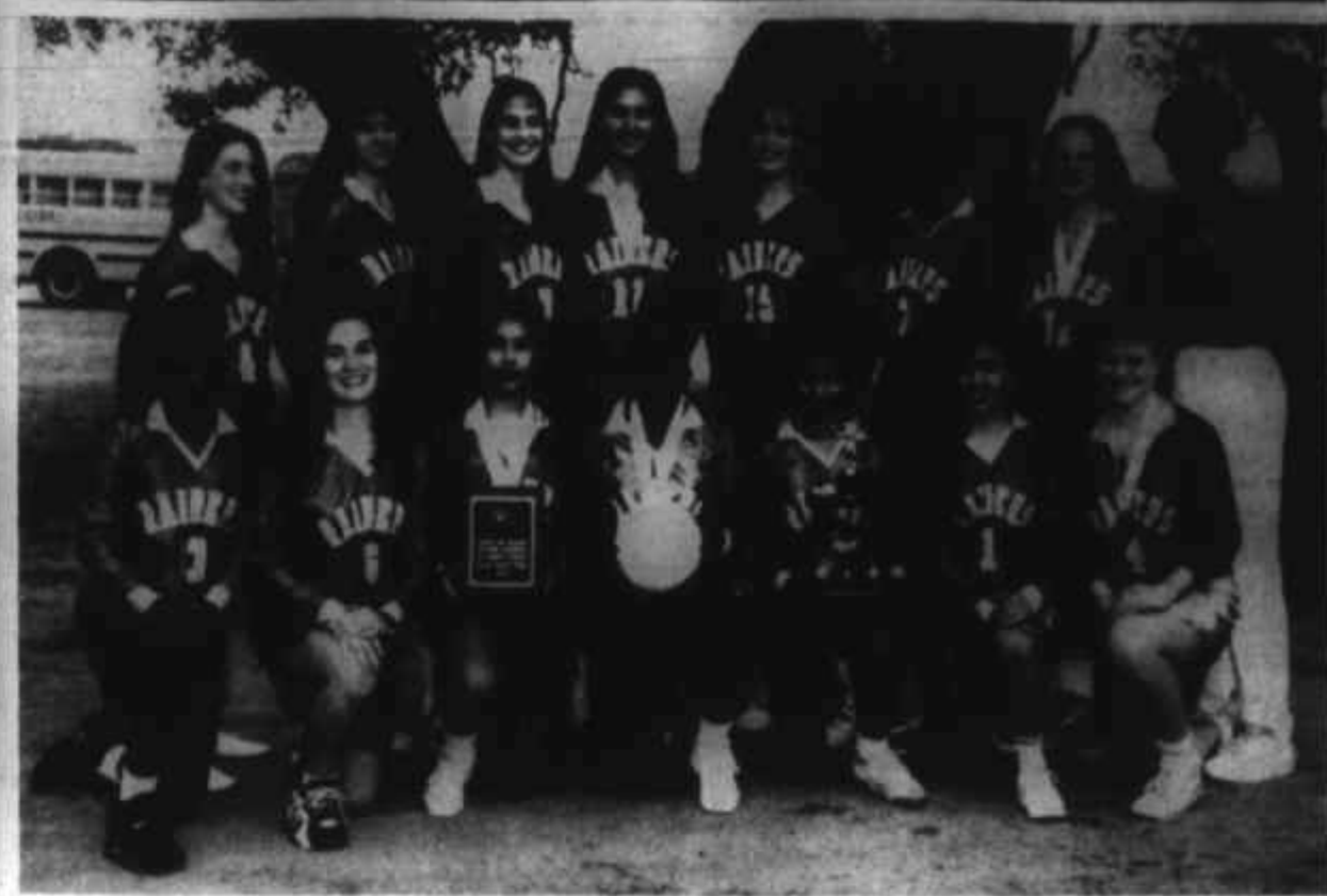
1995 Lady Raiders JV volleyball team